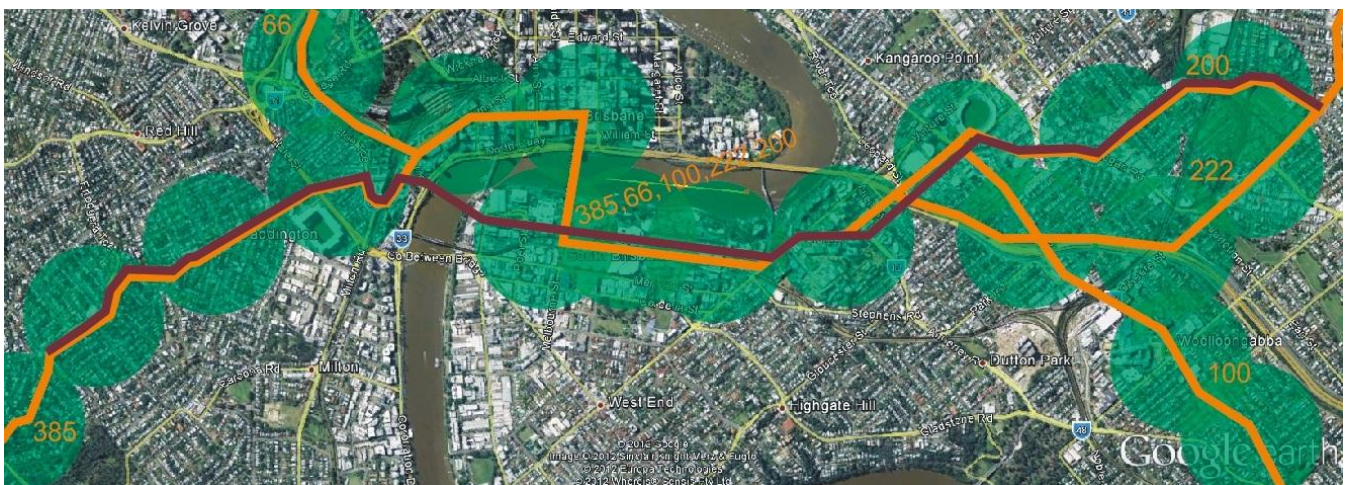
Fig 2: The Maroon Cityglider overlaps within the coverage of the 200 and 385 BUZes entirely, as well as other frequent BUZ routes that provide services to the same catchment area such as the 222, 66 & 100 (existing routes highlighted in orange, walk-up catchments are the green bubbles) . The Maroon City glider does not provide frequent buses to any more people than at current.