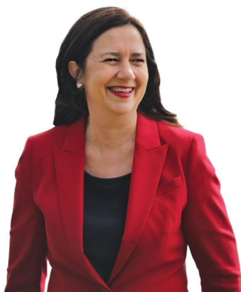
Annastacia Palaszczuk PREMIER OF QUEENSLAND

We will ensure local rail manufacturing supports secure, ongoing and high-skilled manufacturing jobs right across Queensland in places like Maryborough, Rockhampton, Townsville, Cairns and Ipswich.