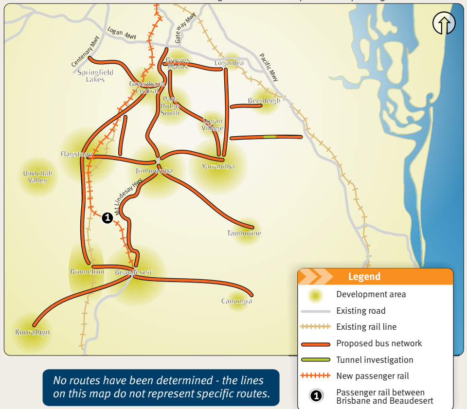
Figure 2 - Post 2026 public transport regional connections

The 2026 public transport networks include an enhanced bus system with improved frequency and route coverage in the Logan City and Scenic Rim Council areas and an improved road network.